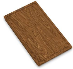
Walnut-wood chopping board 8642 004