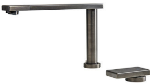
OP GUN METAL satin 8499 106