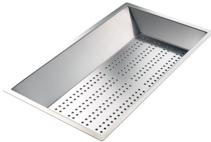
Stainless steel perforated tray 8156 000