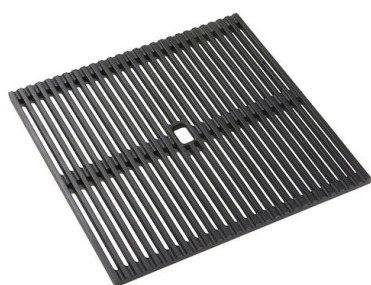
Black Grid 8100 606