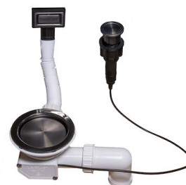
Space Push Gun Metal automatic waste fitting - PO 8407 120