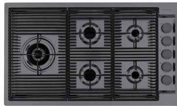
OUTLINE GAS H25 - GUN METAL 7441 006